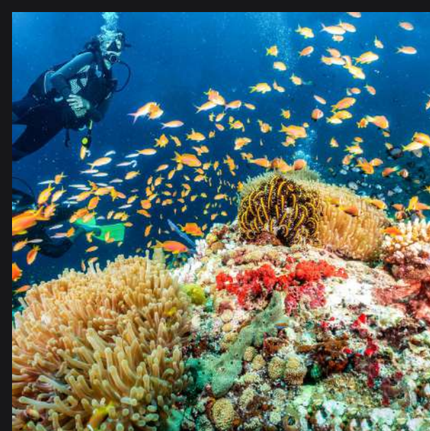
MEXICO & BELIZE JUNE 2022