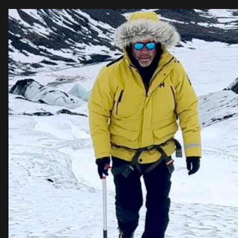
CLIMATE EXPLORER 70 COUNTRIES VISITED