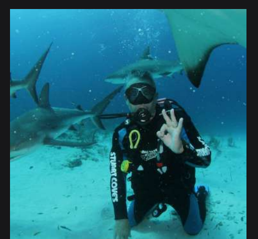
PROFESSIONAL DIVER PADI INSTRUCTOR & TEC DIVER