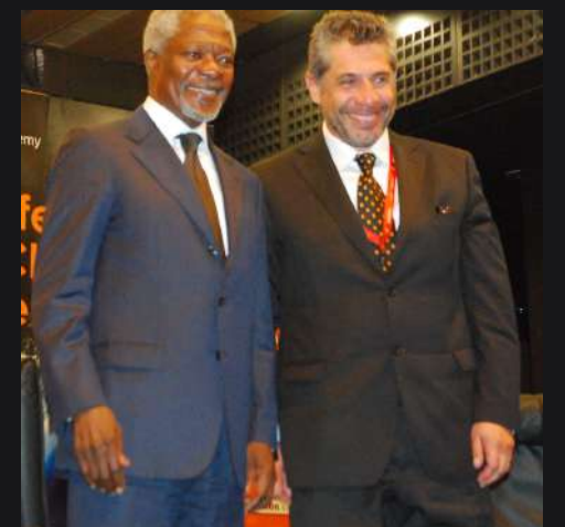
KOFI ANNAN MARBELLA, SPAIN