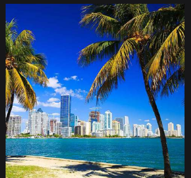
MIAMI & FLORIDA MAY 2022