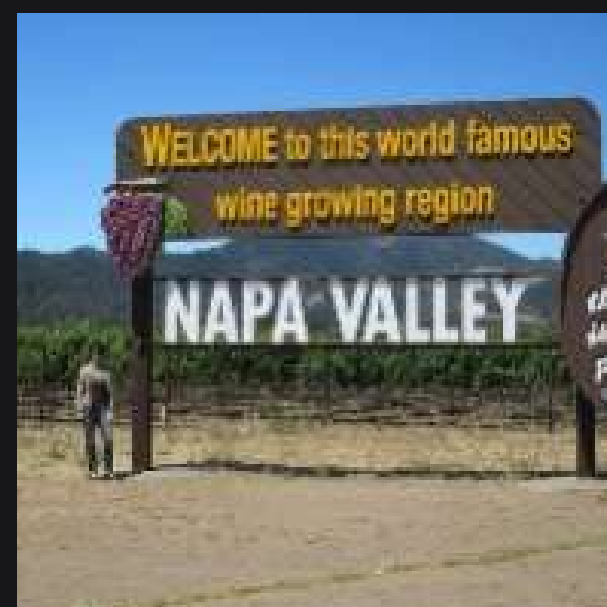
CALIFORNIA & NAPA APRIL 2022