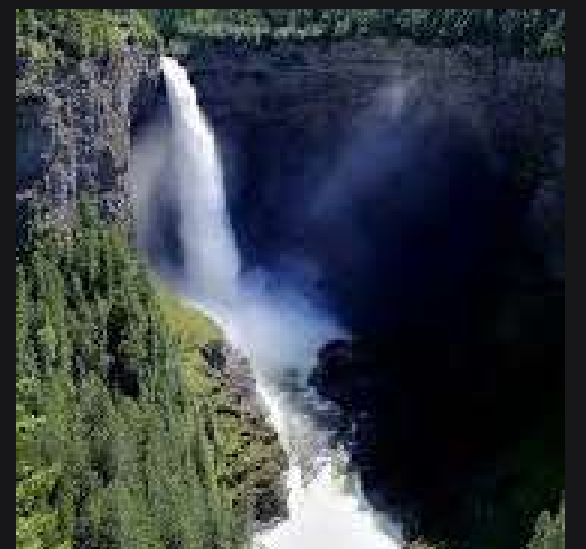
BRITISH COLUMBIA APRIL 2022