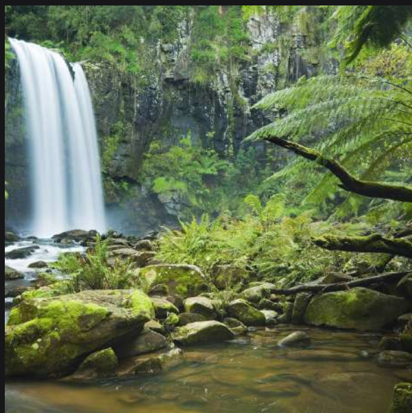
THE AMAZON & RAINFORESTS