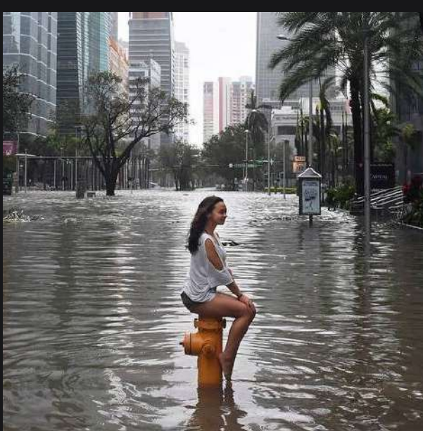
REGIONS IN DANGER OF FLOOD OR DROUGHT