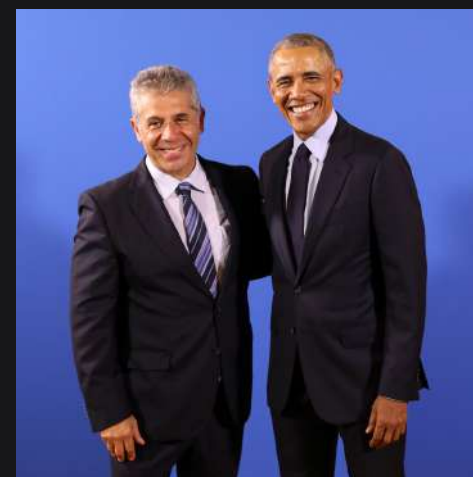
PRESIDENT OBAMA PORTO, PORTUGAL

He is a very charismatic and engaging presenter on topics related to the climate crisis and he is a passionate motivational speaker.