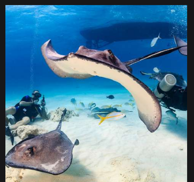
CAYMAN ISLANDS JULY 2022