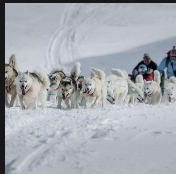
GREENLAND & ICELAND MARCH 2022

Below are listed some of the expeditions and trips already conducted and scheduled for 2022.