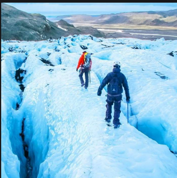
GREENLAND, THE ARCTIC & ANTARCTICA

Create awareness of the impact that the climate crisis is having around the world and how important is to protect the most sensitive regions of the planet mentioned below.