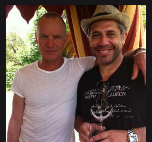
STING TUSCANY, ITALY