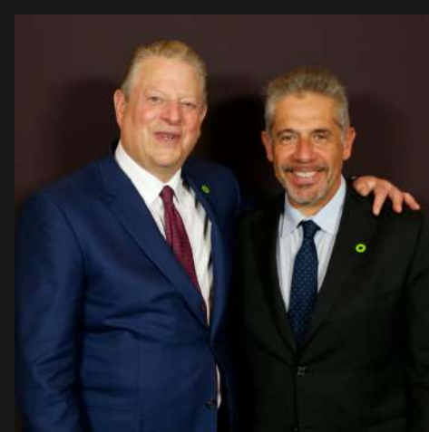
VP AL GORE BARCELONA, SPAIN